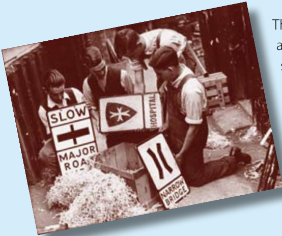
This photo shows a team of our staff in 1953 complete with the obligatory 1950s Brylcreemed hair!!

Up to the 1950s, virtually all road signs were cast in aluminium, fitted with hundreds of glass beads for reflectivity, packed in straw and despatched to customers throughout the UK and in many parts of the then Empire.