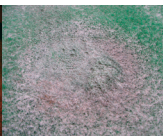
Vandalism – the sand infill protects the system