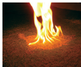
Resistant to fire – damage is limited