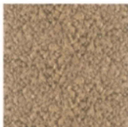
NatraTex ® Buff 1