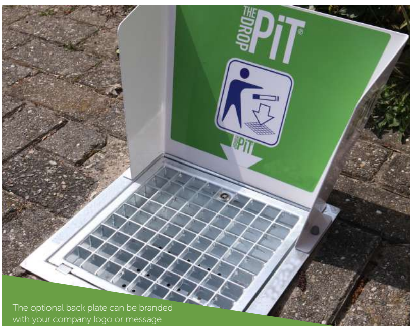
The optional back plate can be branded with your company logo or message.

It holds an estimated 1,500 cigarette ends.