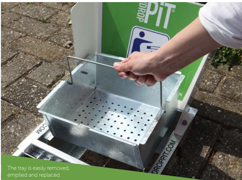
The tray is easily removed, emptied and replaced.

Keep your premises free of unsightly cigarette ends with the innovative new DropPit. The discreet design is installed at ground level in outdoor smoking areas, so that cigarette ends and chewing gum can be dropped straight into the lockable grid, to collect in the tray below.