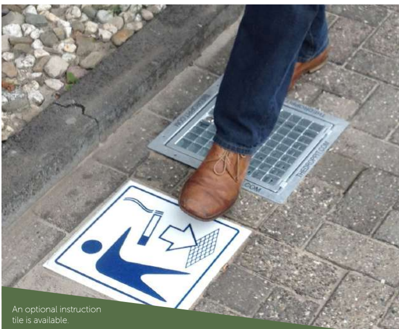
An optional instruction tile is available.

The clever design is made of robust, corrosion resistant galvanised steel. Both the tray and the base feature a perforated bottom for effective drainage of water.