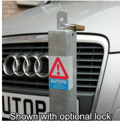
Shown with optional lock