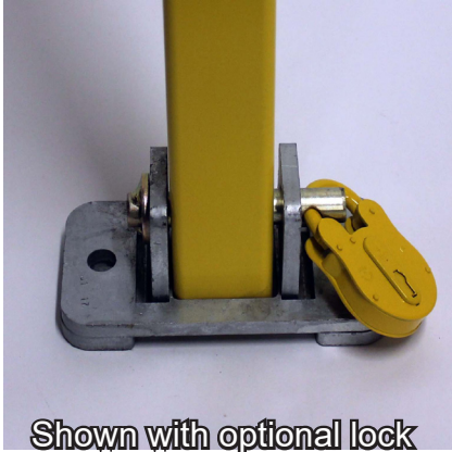
Shown with optional lock