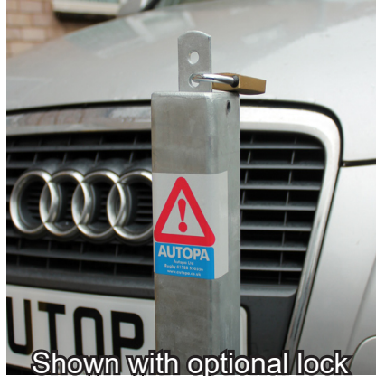
Shown with optional lock