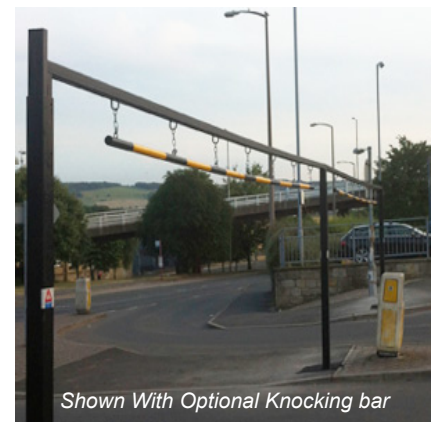
Shown With Optional Knocking bar

The standard clearance is 2.05m with a knock bar, 2.2m without a knock bar.