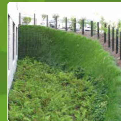
Geoweb® Wall Earth Retention System - MSE