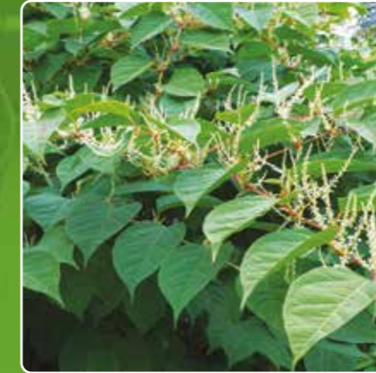
Knotweed Barrier 600 Invasive Weed Control