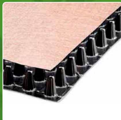
Geocomposite Drainage System Drainage System