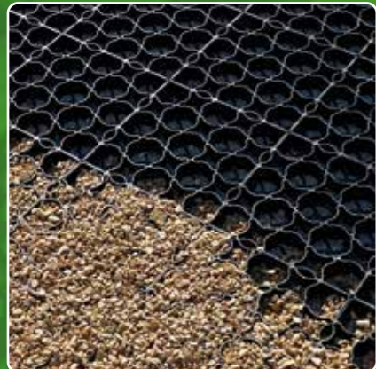
Park Pave Plastic Paving System