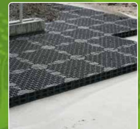
AquaBoxx™ Versatile Modular Crate System