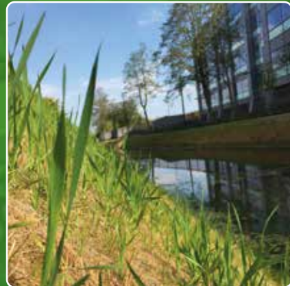
Covamat® Pre-Seeded Erosion Control Blanket