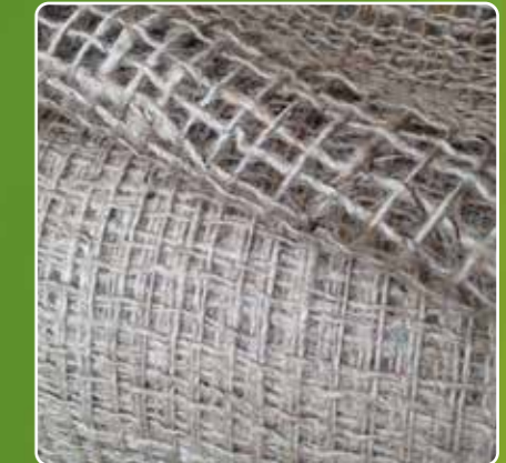
GeoJute™ Biodegradable Erosion Control Matting