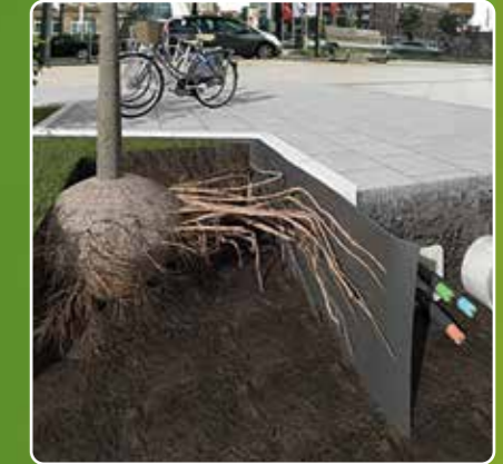
Tree Root Barrier HDPE Heavy Duty Root Barrier