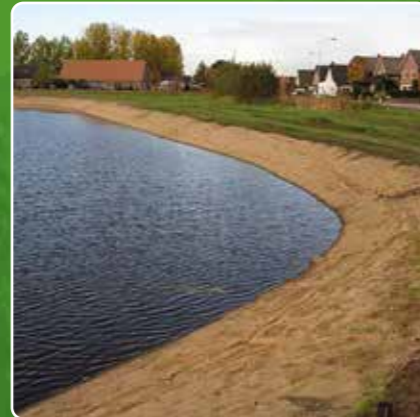
Eromat® Unseeded Erosion Control Blanket