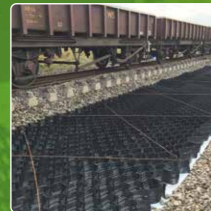
Geoweb® Rail Track Stabilisation System