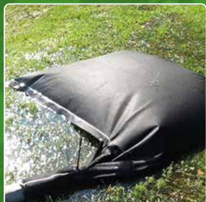
Silt Bags Dewatering Containers