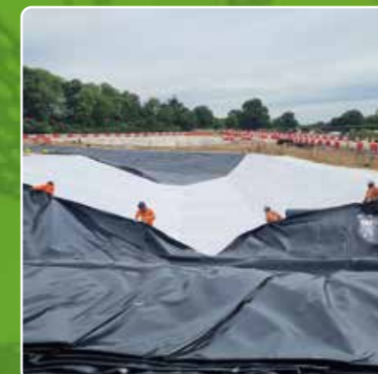
Geomembranes Impermeable Liners