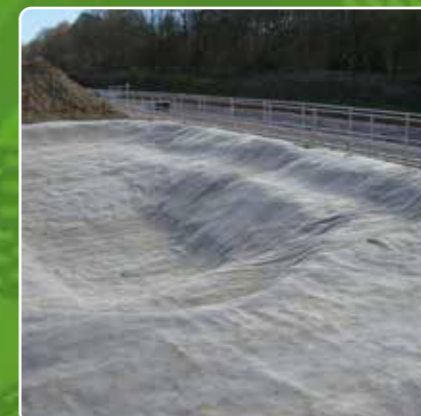
GCL Geosynthetic Clay Liners