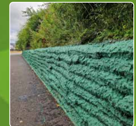
Greenlok™ Vegetated Bag System - MSE