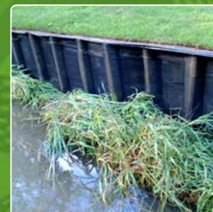
Nicospan Vertical Revetment Fabric