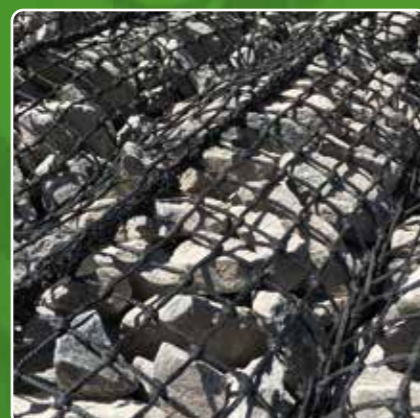
Rock Rolls Flexible Scour Protection