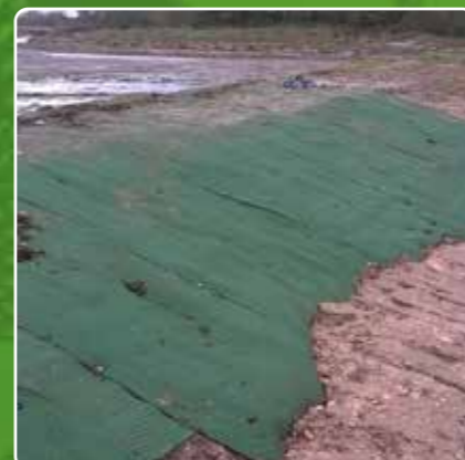
Green Mat Permanent Erosion Control Matting