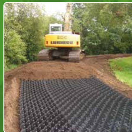
Geoweb® Load Load Support System