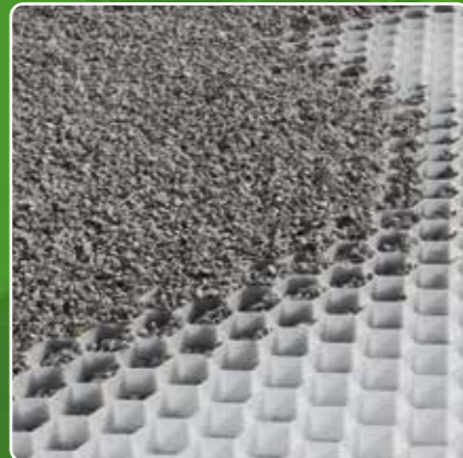
Park Pave Gravel Plastic Paving System with Geotextile Backing