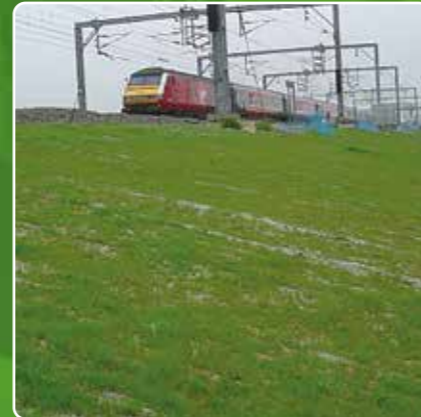
F3 Fire Retardant Erosion Control Blanket