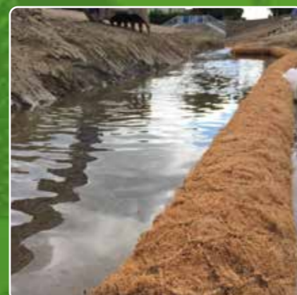
Coir Rolls Soft Edge Erosion Control