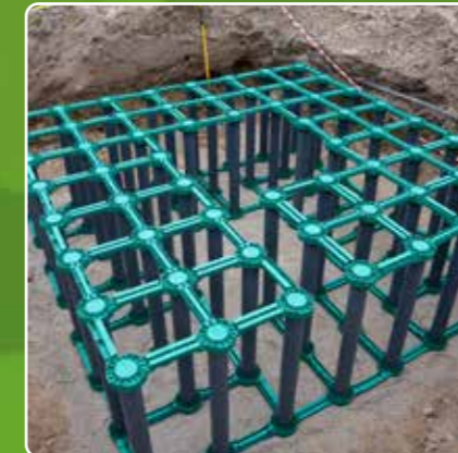
TreeBunker™ Structural Soil Cell System