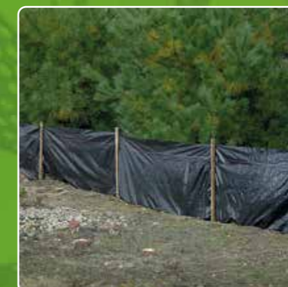
Silt Stop 100 LP Silt Fence