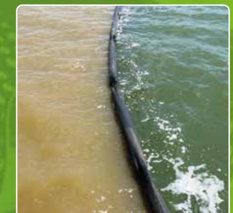
Silt Curtain Silt Entrapment Curtain