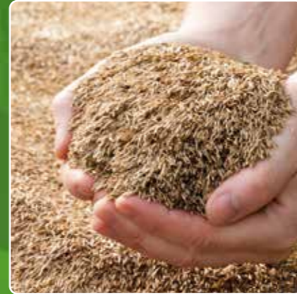
Grass Seed Standard and Specialist Mixes