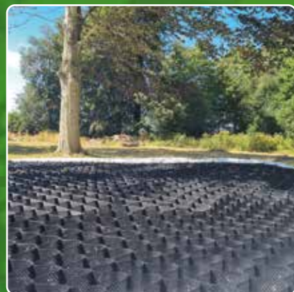
Geoweb® TRP Tree Root Protection System