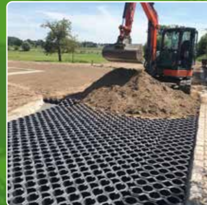
Park Pave Truck Heavy Duty Plastic Paving System