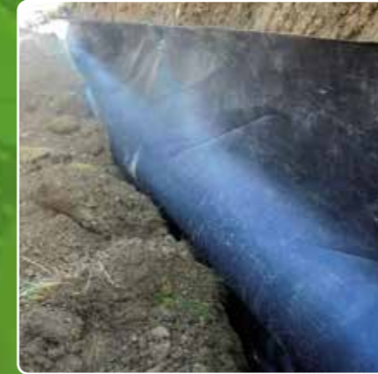
Rootbarrier 400 Trench Lining and Root Control