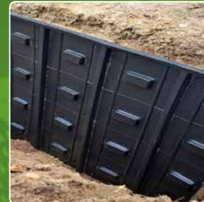
Root Guide Roll Ribbed Root Guiding Roll