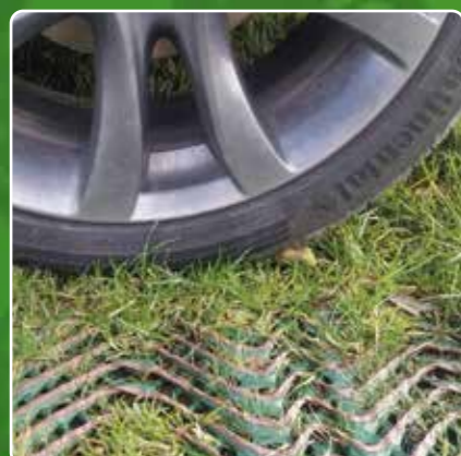
GGR Turf Reinforcement Mesh