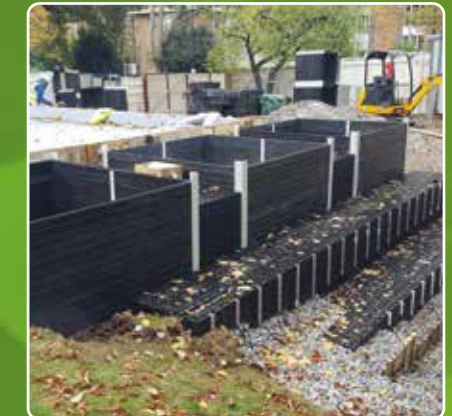
Tree Box HD Engineered Tree Pits