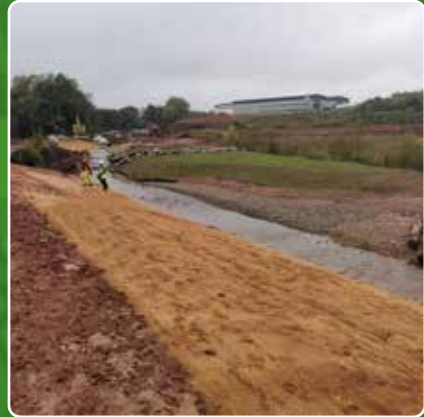
Embankment Mat Heavy Duty Erosion Control Blanket