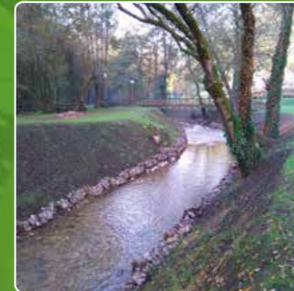
Type 75C Composite Turf Reinforcement Mat