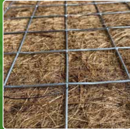
Badger / Rabbit Mat R Anti Vermin Erosion Control Blankets