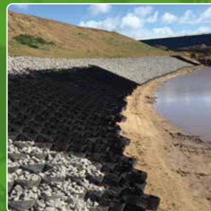
Geoweb® Slope Slope and Channel Protection