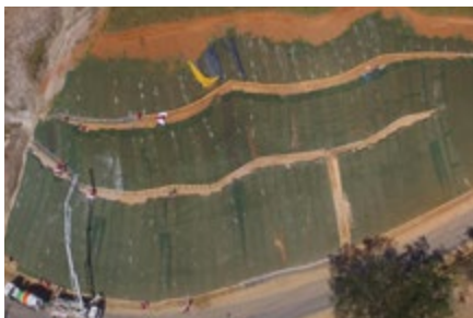
Coating of the face of a soil stapled with MacMat® HS or MacMat® R1