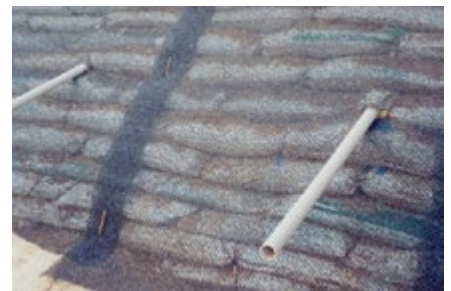
Coating of the face of an erosion recovery with MacMat® 10.1

MacMat® geomats can be produced in green, brown* and black*. Consult our engineers to help define the best MacMat® geomat for each type of application.