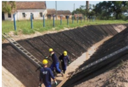
Stormwater drainage channel coating with MacMat® 10.1