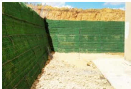
Coating of the face of containments in soil reinforced with MacMat® 10.1