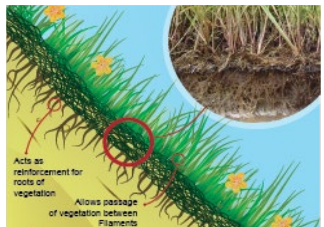
After the development of vegetation, MacMat® strengthens the roots and ensures the longevity of protection created.