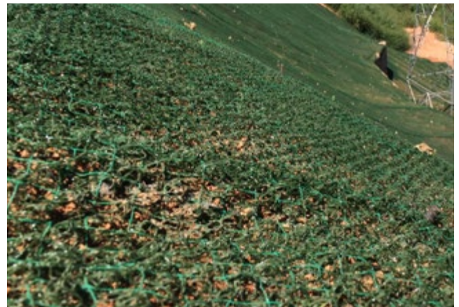
Slope coating with MacMat® R3