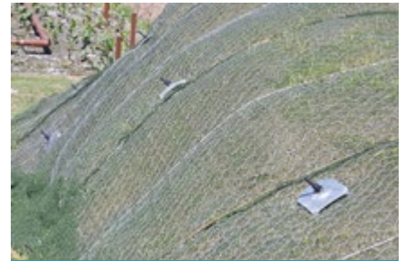
Coating the face of a stapled soil with MacMat® HS