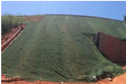
Slope cladding above a retaining wall in gabions with MacMat® R3