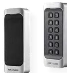
Electronic Access Control