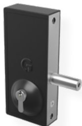
Lock & Key