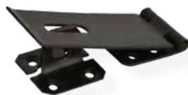
Hasp & Staple Lock