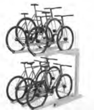
Two Tier Cycle Rack