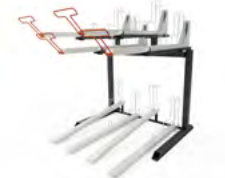
Gas Assisted Two Tier Cycle Rack