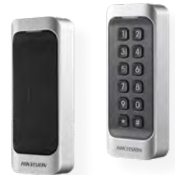
Electronic Access Control