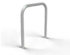
Sheffield Cycle Stands