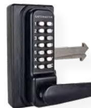
Sliding Gate Code Lock