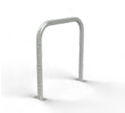
Sheffield Cycle Stands