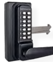
Sliding Gate Code Lock