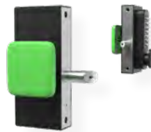
Swing Gate Mechanical Lock