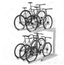
Two Tier Cycle Rack