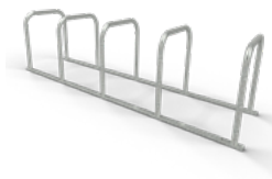
Toastrack Cycle Stands