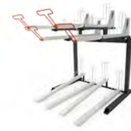
Gas Assisted Two Tier Cycle Rack