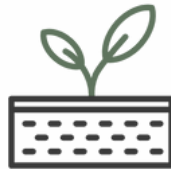
Soil Health Monitoring