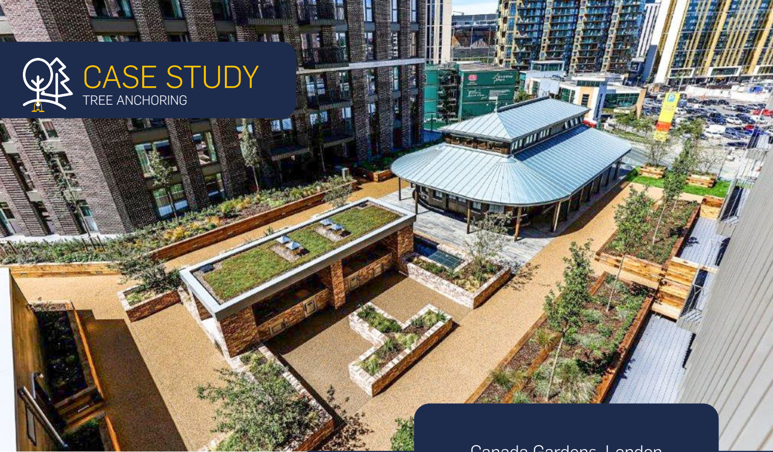
Canada Gardens, London