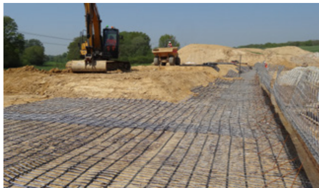
ParaDrain® used with Green Terramesh®