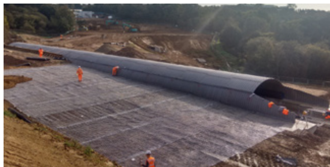
ParaDrain® reinforcing marginal soils