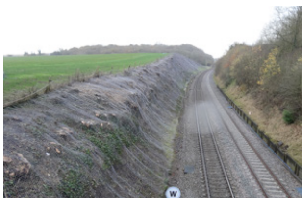
Renomesh installed on railway embankment