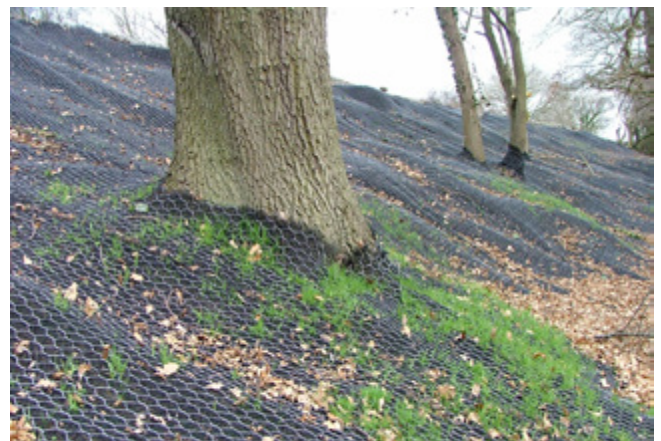
DT mesh flexibility enables variable slope profile and obstacles to be accommodated easily