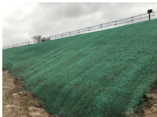
Renomesh installed on railway embankment