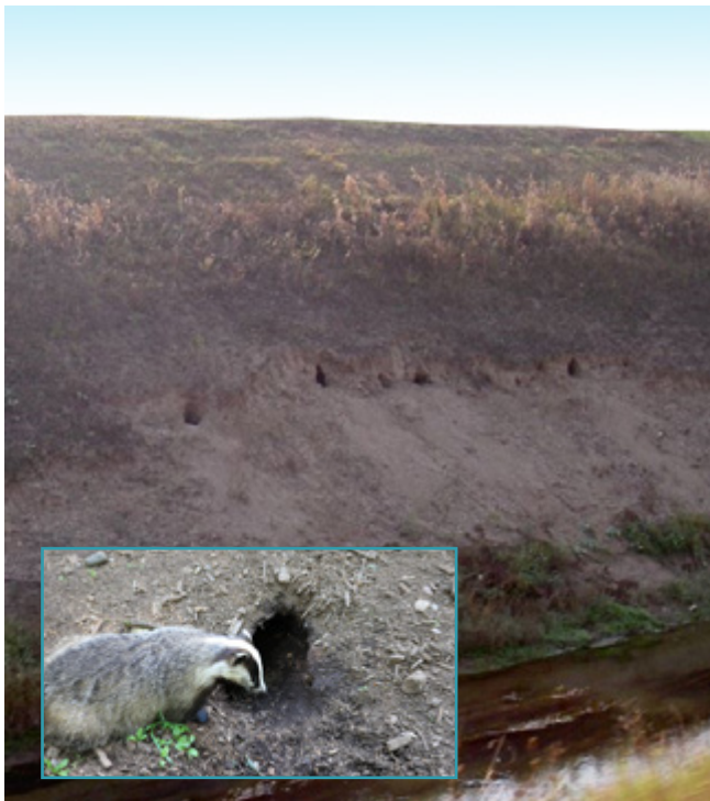
Mammal burrow damage to slope causing vegetation loss and instability

Badgers, rabbits, beavers and other burrowing mammals can damage earthworks, embankments and dykes. This can lead to an increased risk of instability, especially if surface water can then penetrate the slope.