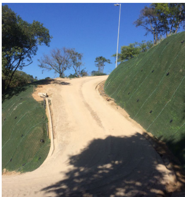
MacMat® R surface protection & stabilisation for roads

*Tolerance exists on parameters. See technical data sheet for details.