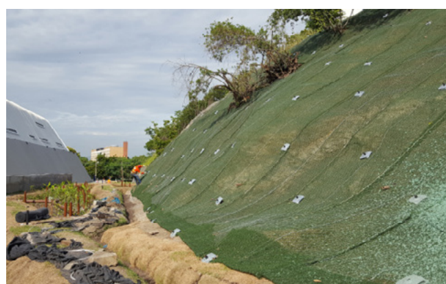
MacMat® R soil stabilisation in industrial park

Maccaferri Ltd T: +(44) 01865 770 555 E: info.uk@maccaferri.com