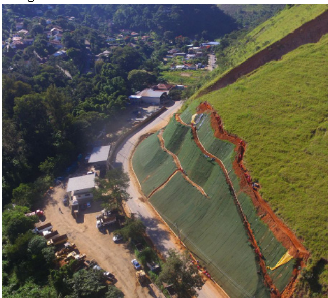
MacMat® R stabilisation of a soil slope face

MacMat® has achieved an Environmental Product Declaration which provides transparent, reliable and comparable life cycle environmental data.