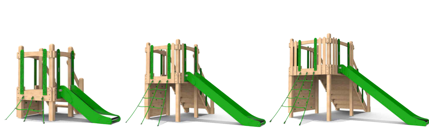
Large Deck Width