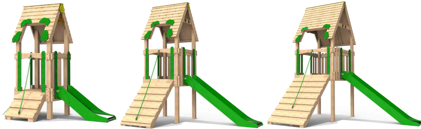
Large Deck Width