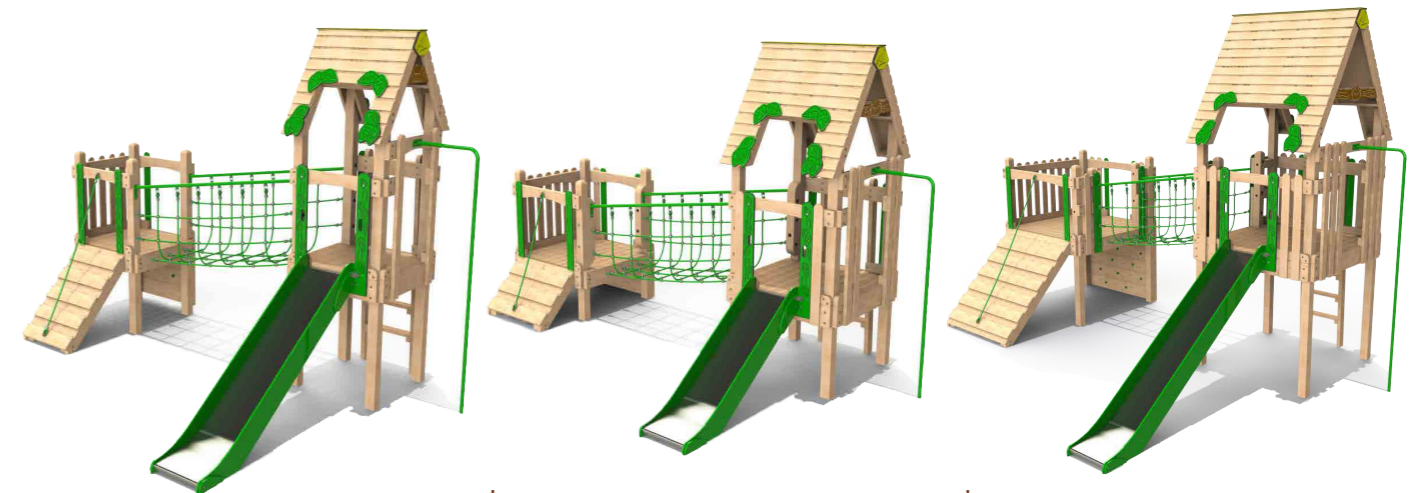
Large Deck Width