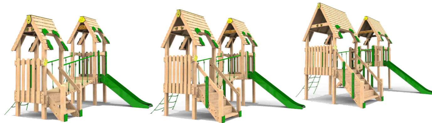
Large Deck Width