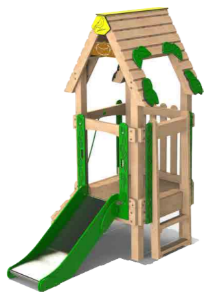
Large Deck Width