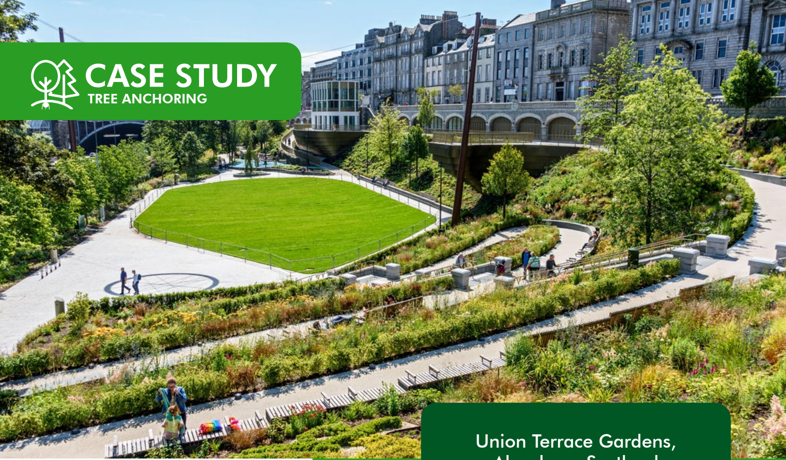
Union Terrace Gardens, Aberdeen, Scotland