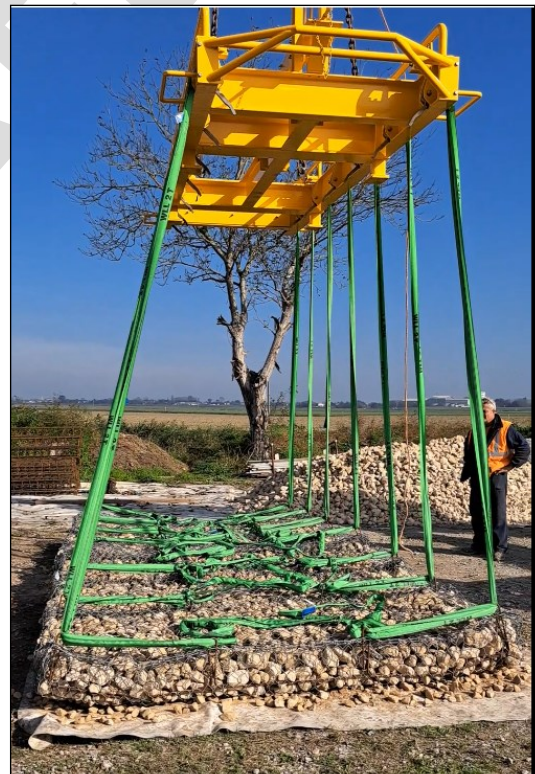
Figure 3: The lifting frame operating with a RenoMac Plus unit before (left) and after (right) releasing the hooks