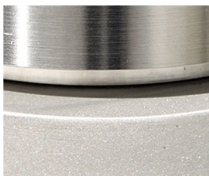
Grade 304 Stainless Steel

The colours shown are a guide only. Please check a colour chart to see the actual colour.