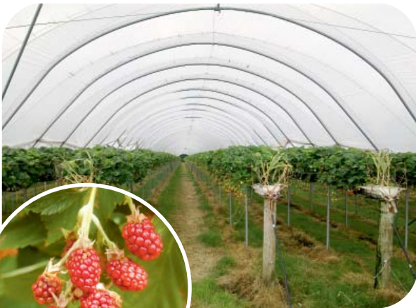
Table-top trellis systems are fast becoming the preferred method for growing soft fruits, such as strawberries. It offers a number of benefits over traditional bed grown techniques. Raising the plant helps protect it against frost and disease, it makes it easier and faster to pick and can also increase the yield.

The load generated by table-top fruit can increase significantly during the growing season. Choosing the correct anchor system to support growth is a vital consideration. The S4V1S and S6V1S have an ultimate holding capacity of 1000kg depending on soil conditions, and are perfect for table-top trellis systems.