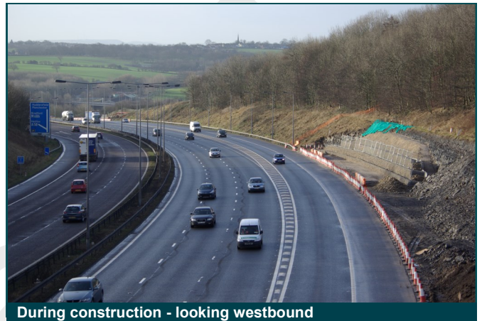
During construction - looking westbound

Mr Scott continued: "Space is at a premium here and the gabion wall allowed us to fit in the overall lane width requirements without resorting to additional land-take."