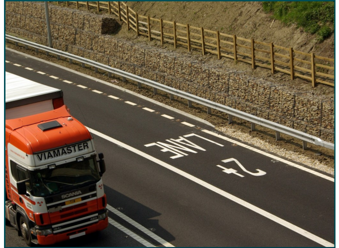
Post-construction - East bound

Work began on the car-share lane in October 2007 and the project was declared open on 20th March 2008, by Transport Secretary, Ruth Kelly.