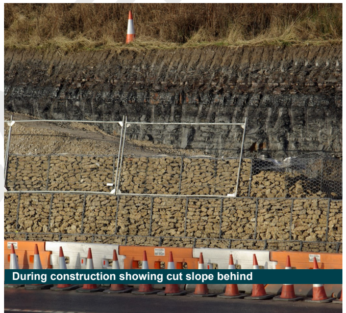
During construction showing cut slope behind