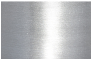
Grade 304 Stainless Steel