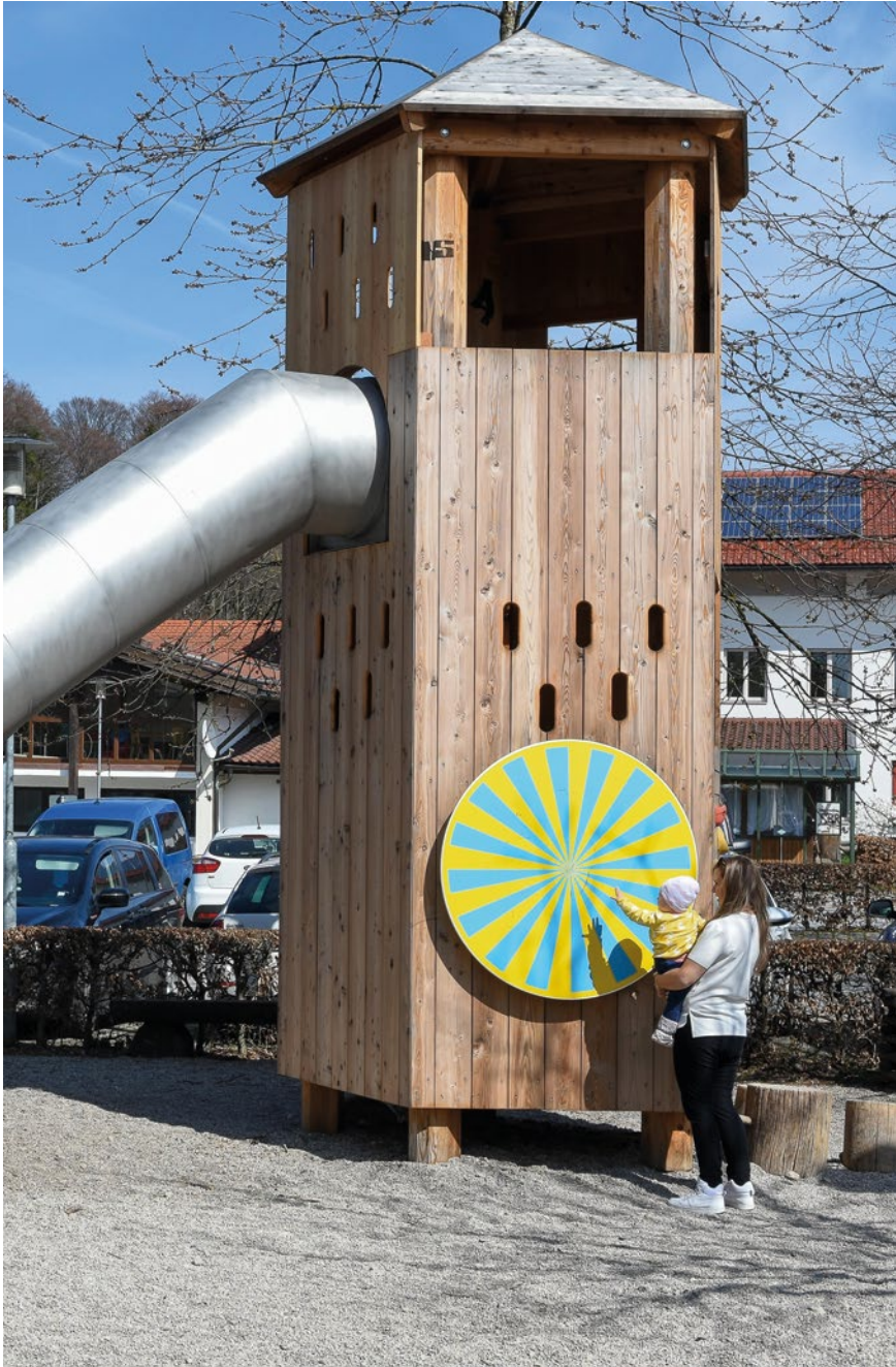
Order No. 10.22450 Rotating Coloured Disc for wall attachment