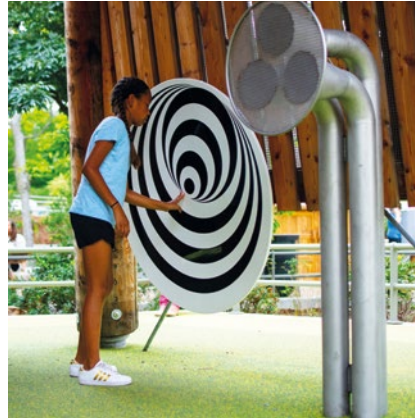
Order No. 10.22550 Spiral 2 as wall attachment

Here the eye perceives a pulsating physical motion similar to breathing in and out. The square and circle play around each other, pulling together and drawing outwards.