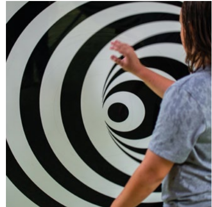
Order No. 10.22550 Funnel 2 for wall attachment