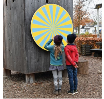
Order No. 10.22450 Colour Disc as wall attachment