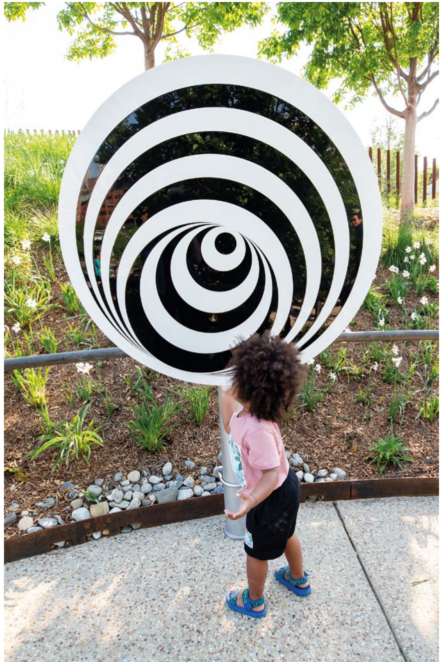
Order No. 10.22505 Spiral 2 with post made of stainless steel, Photo © Liz Ligon