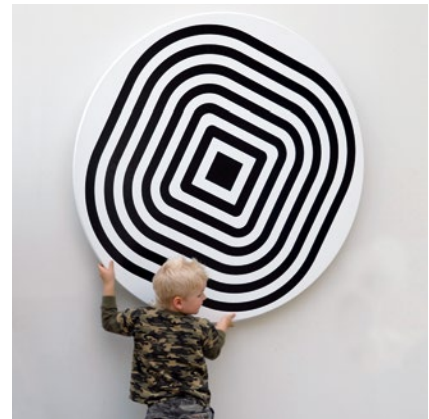
Order No. 10.22350 Pulsation for wall attachment