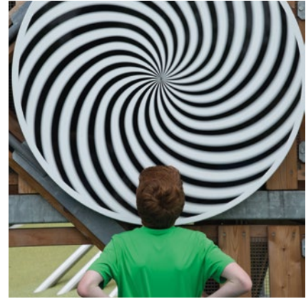
Order No. 10.22850 Spiral 2 for wall attachment

The disc is divided into blue and yellow sectors. Turning creates not only a mixture of colours, but also the colour green and after that the complementary colour red. The observer experiences the effect of colour as a physical, non-material appearance.