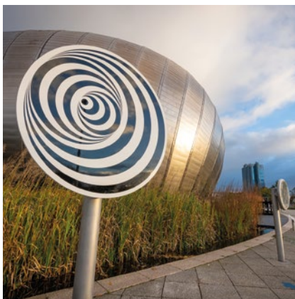
Order No. 10.22505 Spiral 2 with post made of stainless steel, Photo © Paul Upward