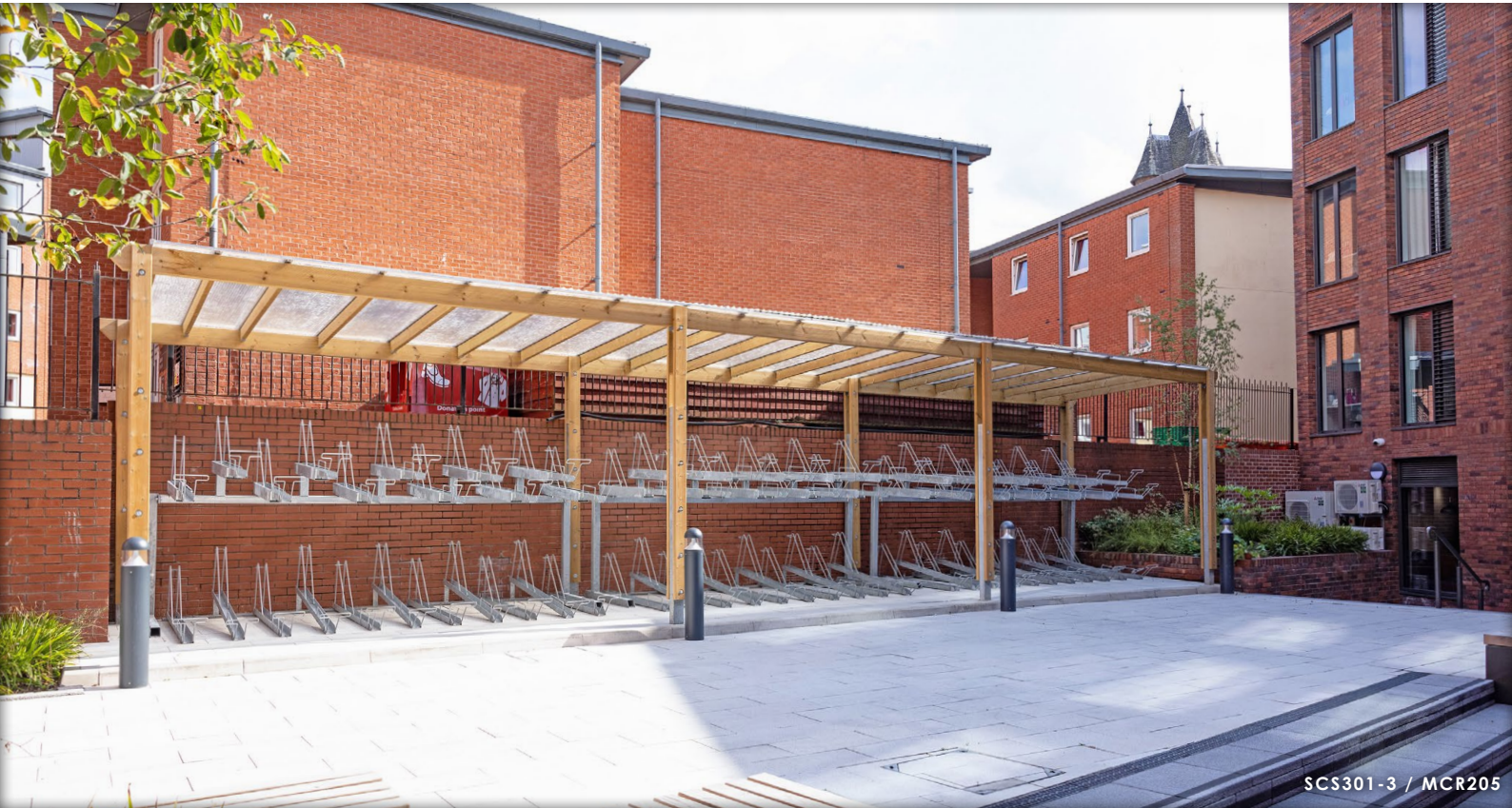
SCS301-3 / MCR205