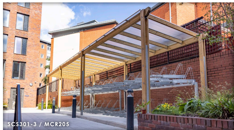
SCS301-3 / MCR205

Langley Design were delighted to be chosen by the now defunct NMCN Construction to provide a bespoke sized Sheldon Cycle Store (SCS301) for the Castle Street development. This student accommodation scheme provided housing for students at the Leicester and De Montfort Universities.