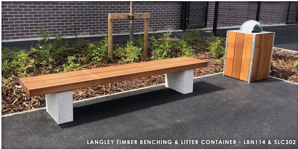
LANGLEY TIMBER BENCHING & LITTER CONTAINER - LBN114 & SLC302