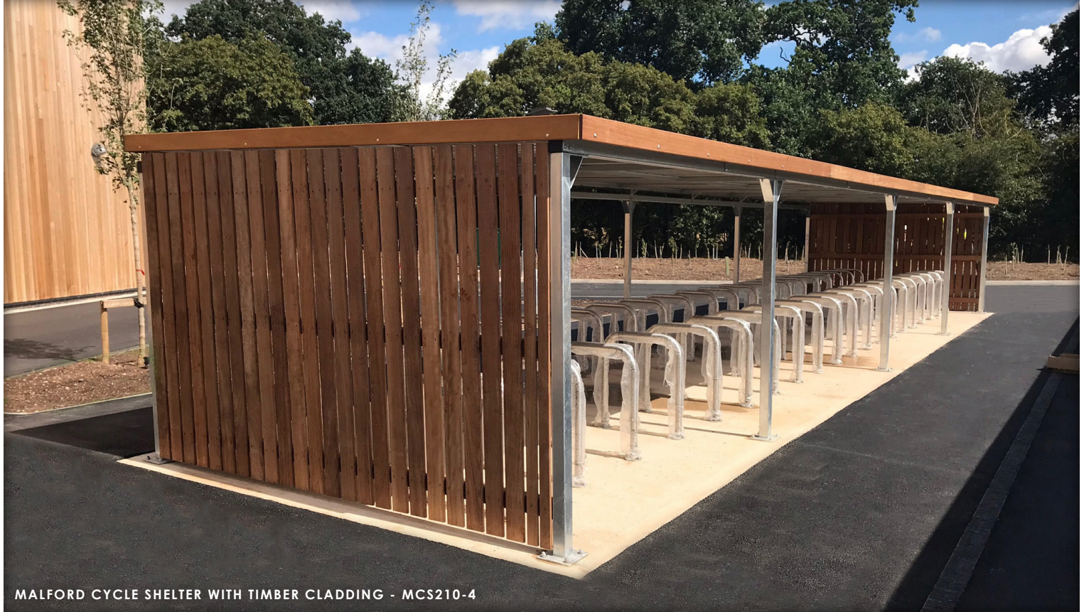
MALFORD CYCLE SHELTER WITH TIMBER CLADDING - MCS210-4