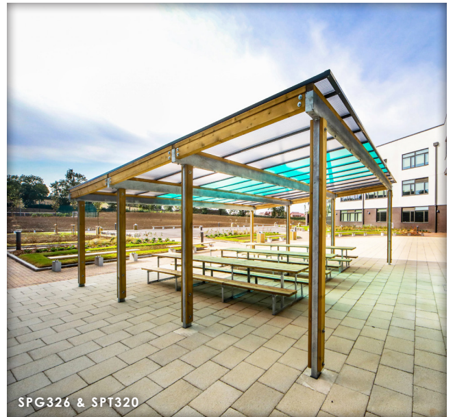
SPG326 & SPT320