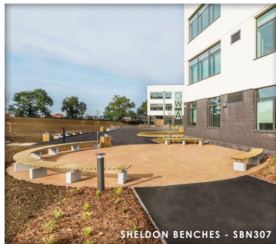
SHELDON BENCHES - SBN307

Project Name: Great Western Academy Swindon