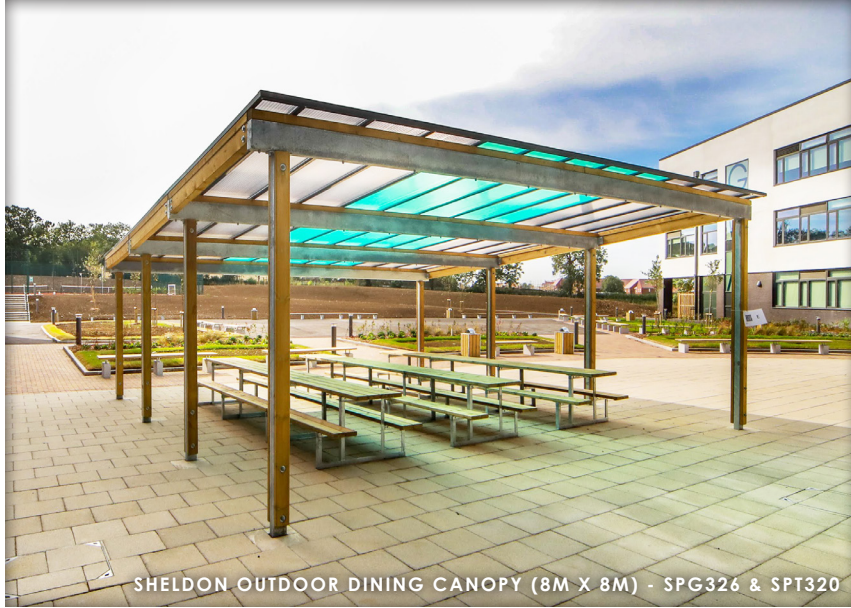
SHELDON OUTDOOR DINING CANOPY (8M X 8M) - SPG326 & SPT320