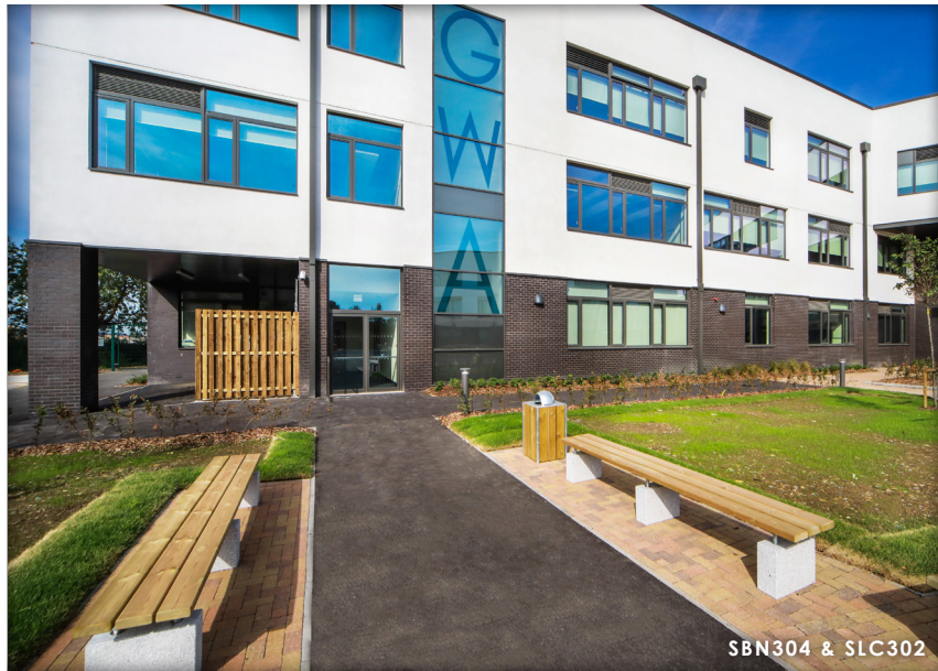
SBN304 & SLC302